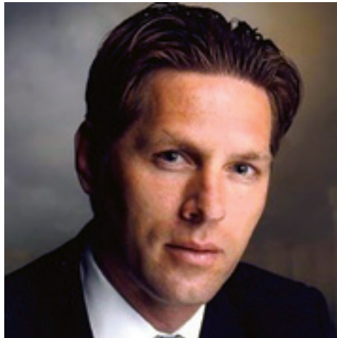
President and CEO of Western Regional OTB and Batavia Downs Gaming.

Other featured acts for this year include Journey, June 26; Molly Hatchet, July 10; Skid Row, July 17; Johnny Lang, July 24; Donald Felder (formerly of the Eagles), July