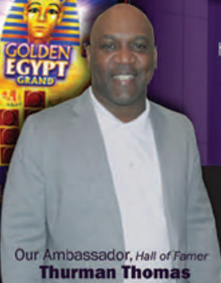
Our Ambassador, Hall of Famer Thurman Thomas

DINE • PLAY • STAY BOOK NOW AT TheHotelAtBataviaDowns.com